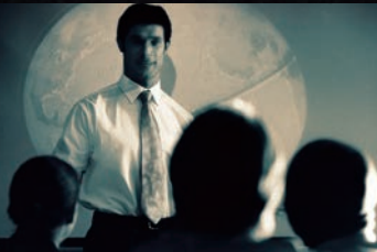
Along with writing assignments, group work is also given.

Through presentation and subsequent discussion with guest lecturers and vigorous interactions with instructors in the forms of debate exercises, detailed guidance on writing assignments, students are expected to learn what it takes to be a leader (mindset, action, and challenging spirit).